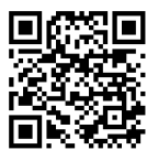
FiPL in National Parks

It is clear that FiPL has been a highly popular and effective programme that delivers real solutions for nature, climate, people and place, for farmers, land managers and communities.