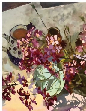
7 Hilary Carr Oil paintings