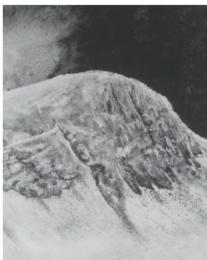
5 Kevin Brown Watercolours & prints