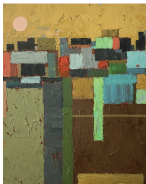
6 Terry Hird Paintings