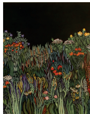
3 Gill Barron Paintings