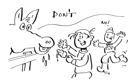
The animals have a balanced diet so avoid feeding them, unless asked to.