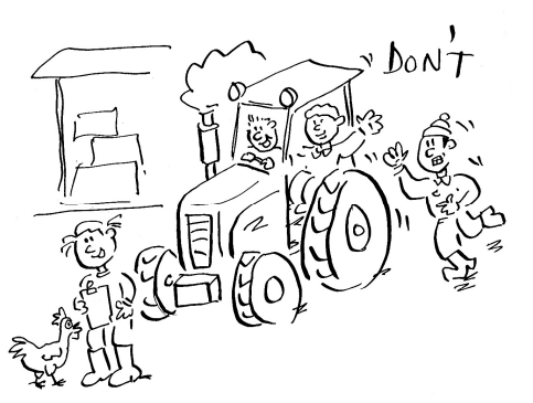
SECTION 4: The Farm

Do not handle farm equipment or machinery unless permitted to do so by farm staff