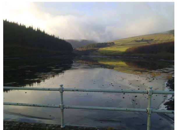
Figure 2 Lower Ogden reservoir