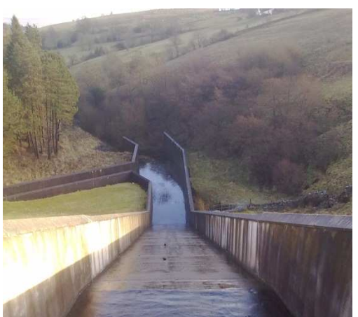
Figure3 The dry overflow