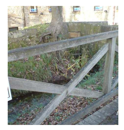
Figure 2 The leat running to the mill building

The potential scheme would involve installing a turbine directly onto the millrace approximately at the footbridge in front of Willow Mill.