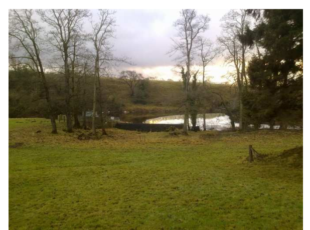
Figure 3 The weir from Waddow Hall