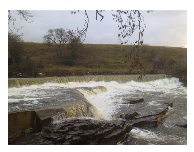
Figure 2 Weir from below showing sluice gates on the far side