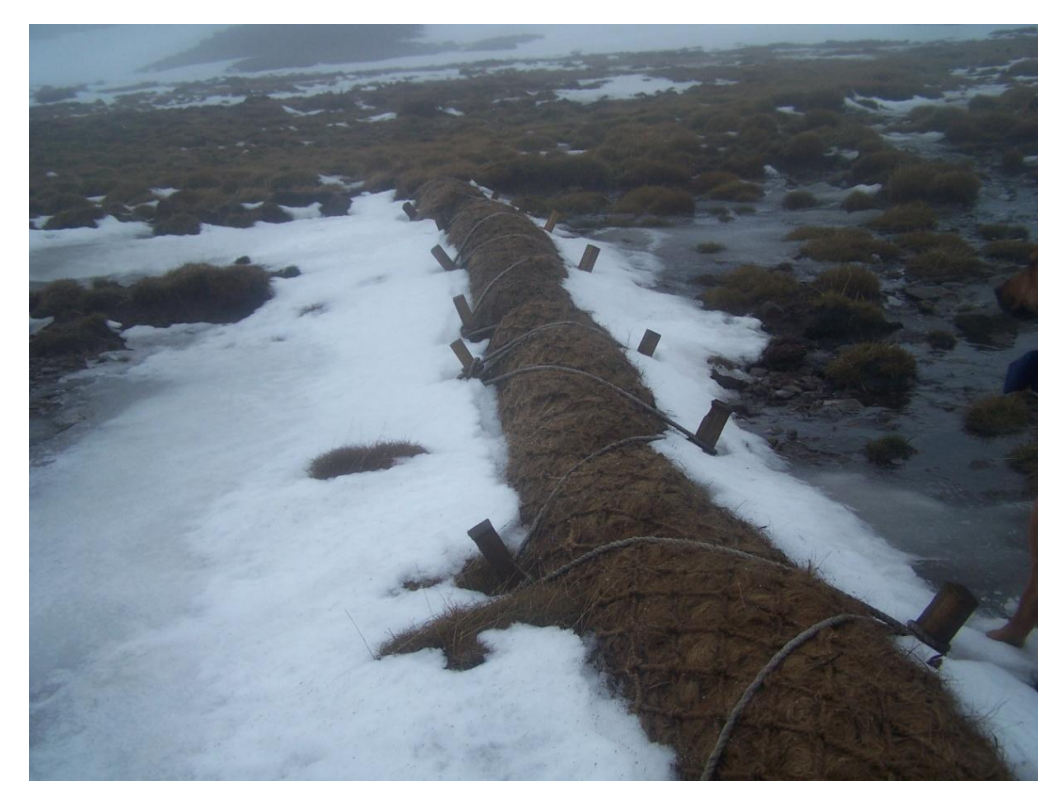
Example of coir log in situ on mineral soil at Holme House(from 2012 work), 14 Feb 2013