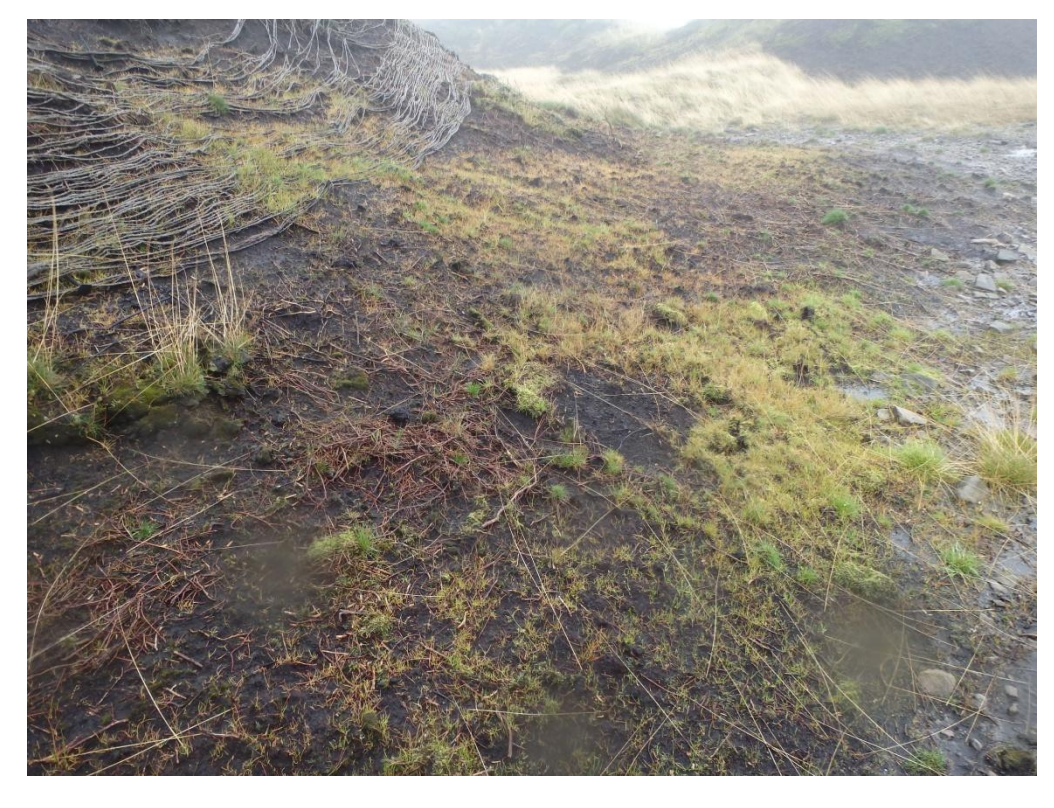
Holme House Fell showing nurse crop germination in need of further lime and seed, September 2013