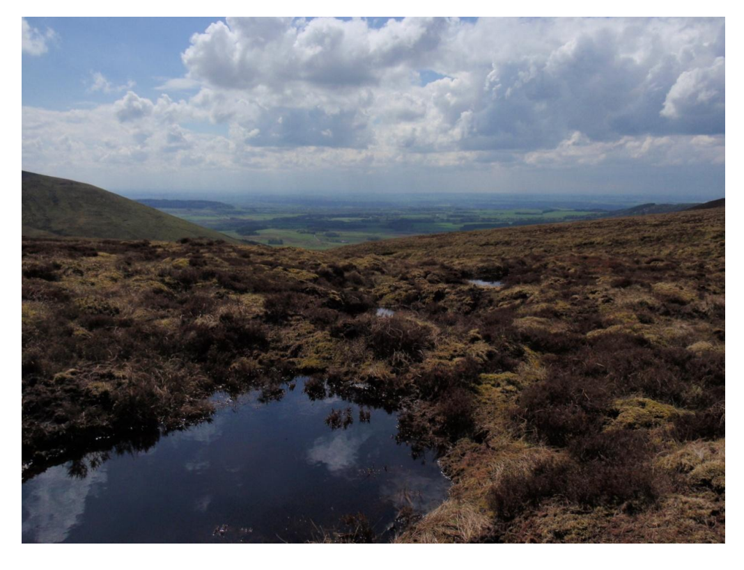
Gully at Fiendsdale Head re-profiled with check dams in place, May 2013