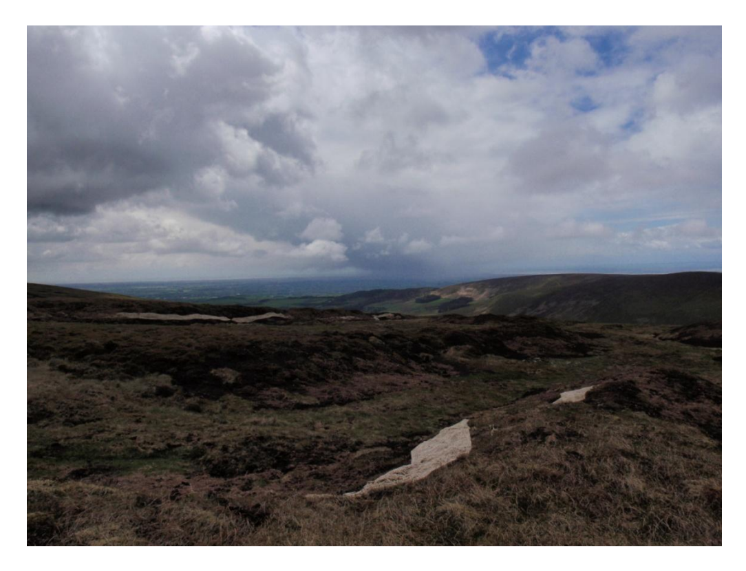
Holme House Fell re-profiled hags with geo-jute and heather brash, May 2013