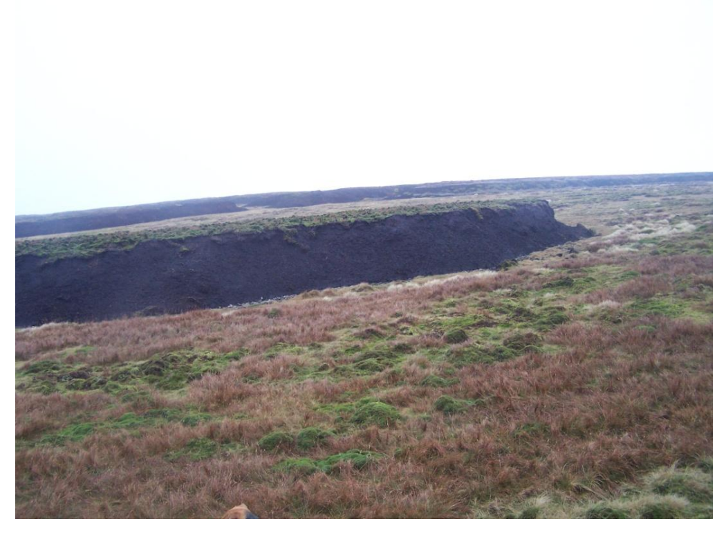
Hags at Holme House Fell, still in need of re-profiling, 1 Feb 2013