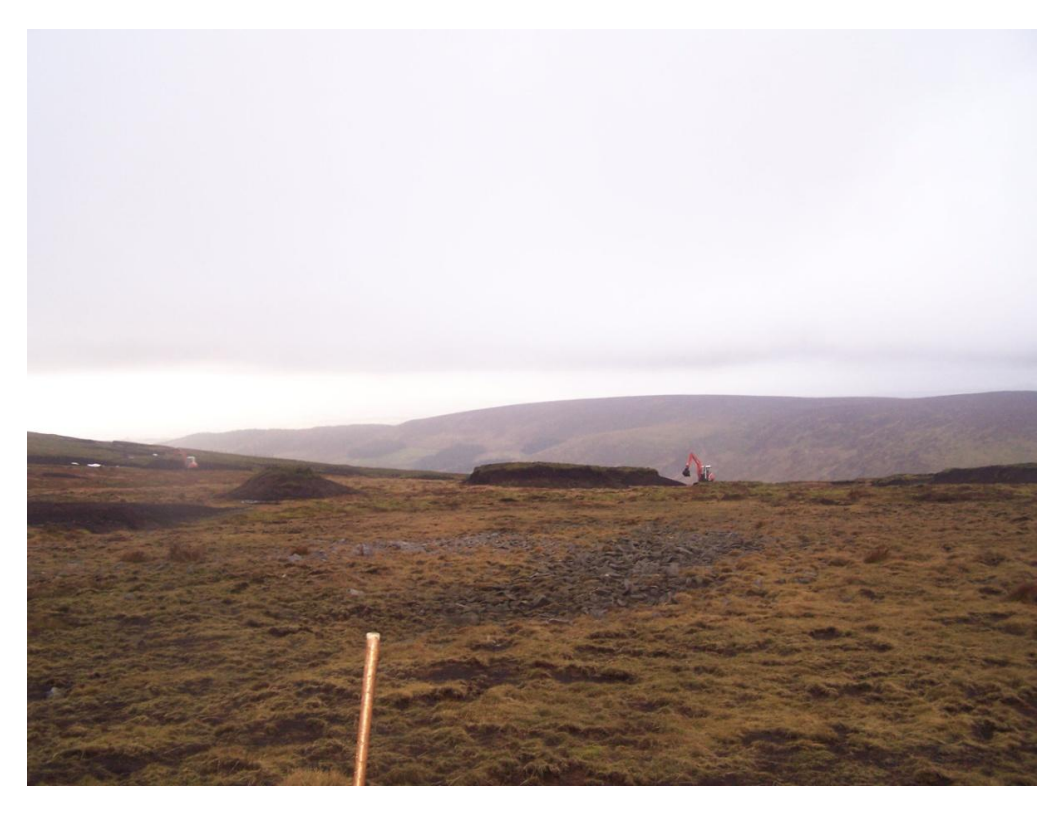
Machine reprofiling at Fairsnape, 1 Feb 2013