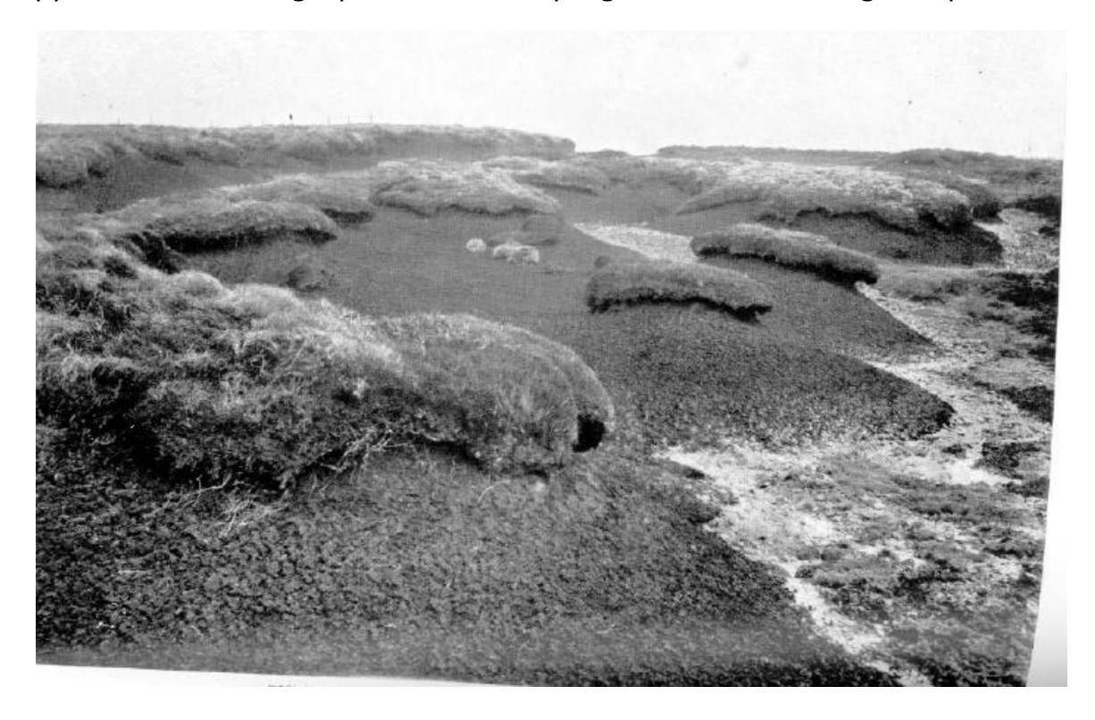
Haggs and bare peat on Fairsnape, 1907