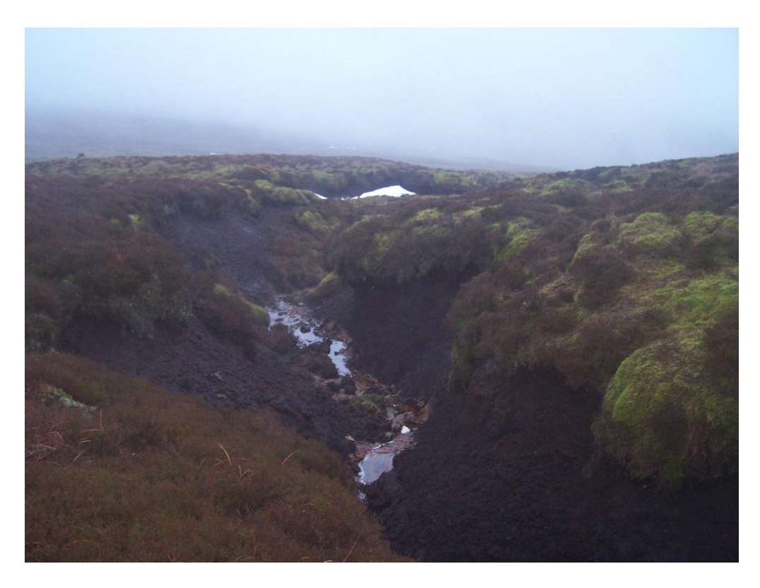
Gully at Fiendsdale Head to be re-profiled, 1 Feb 2013