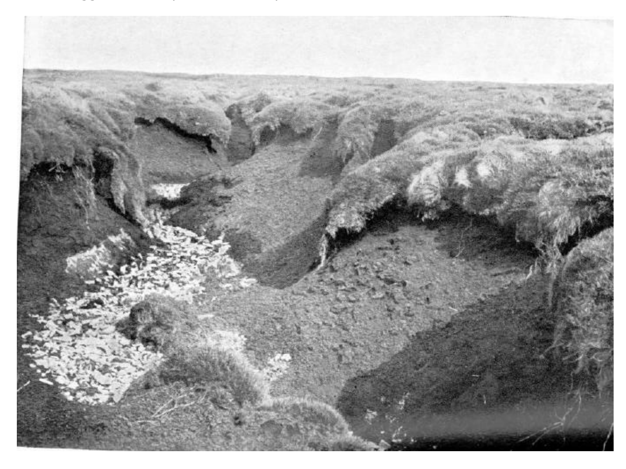
Deep gullies and drip edges on Fairsnape summit, 1907