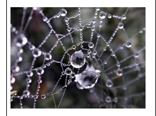
Can you see any cobwebs or spiders?

The webs are easier to see if it's misty or frosty.