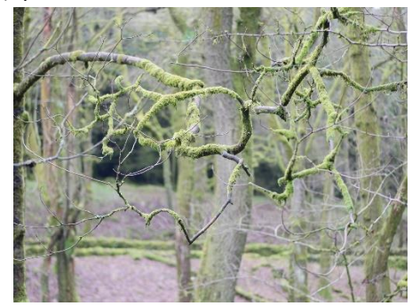
Moss often grows on the ground but in the dark damp parts of the forest there is a lot growing on the trees. Do you think it looks spooky?