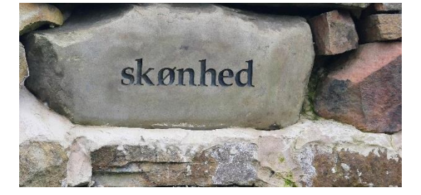
Post 18 and the old stone gate post.