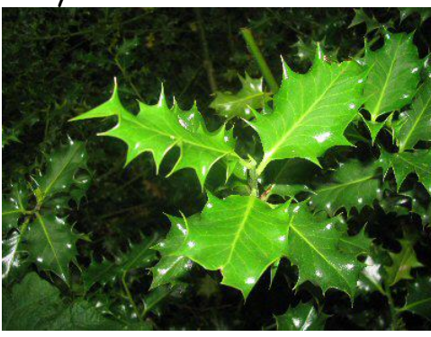
Holly is evergreen, so its leaves remain green year round. Be careful the leaves can be very spikey.