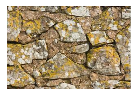
How many different coloured lichens can you see?