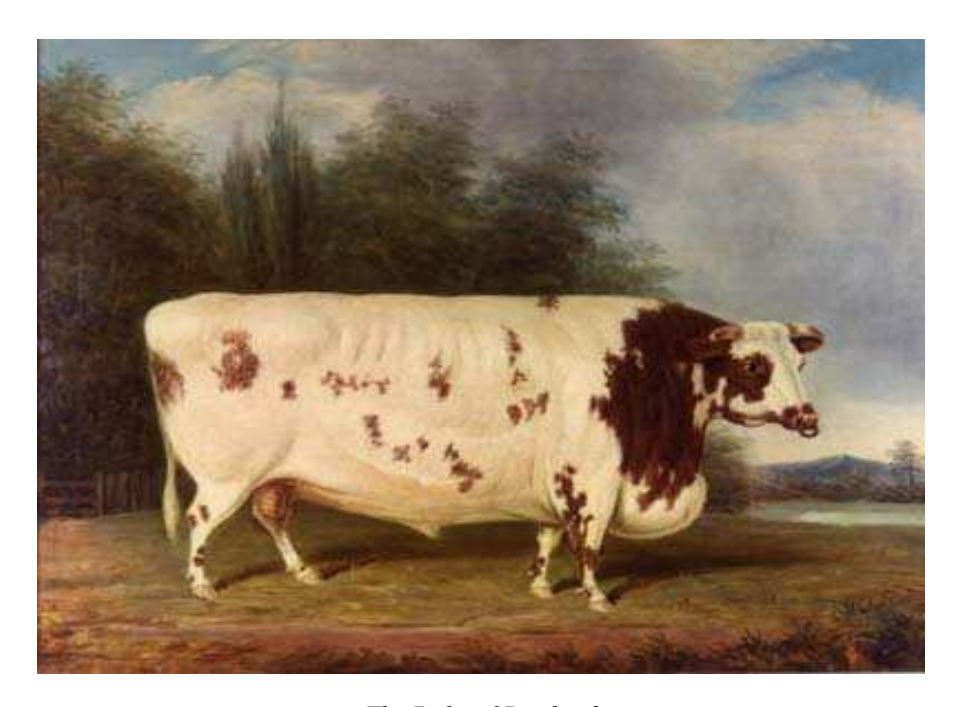
The Duke of Bowland

On his 5,000-acre Thorneyholme Hall estate, Eastwood bred shorthorn cattle, including a prize bull, aptly-named The Duke of Bowland , which he sold to the Duke of Buccleuch for a handsome sum (Sinclair 1907):