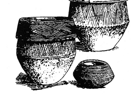
Urns found at the site which can now be seen at the Harris Museum, Preston