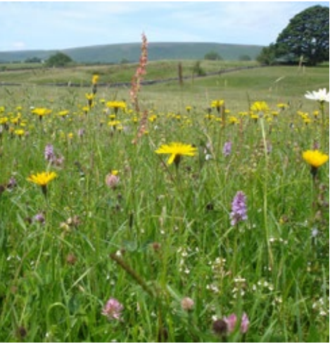
Bowland Hay Meadow

Discover Bowland and explore 803 sq km of rural Lancashire and Yorkshire.