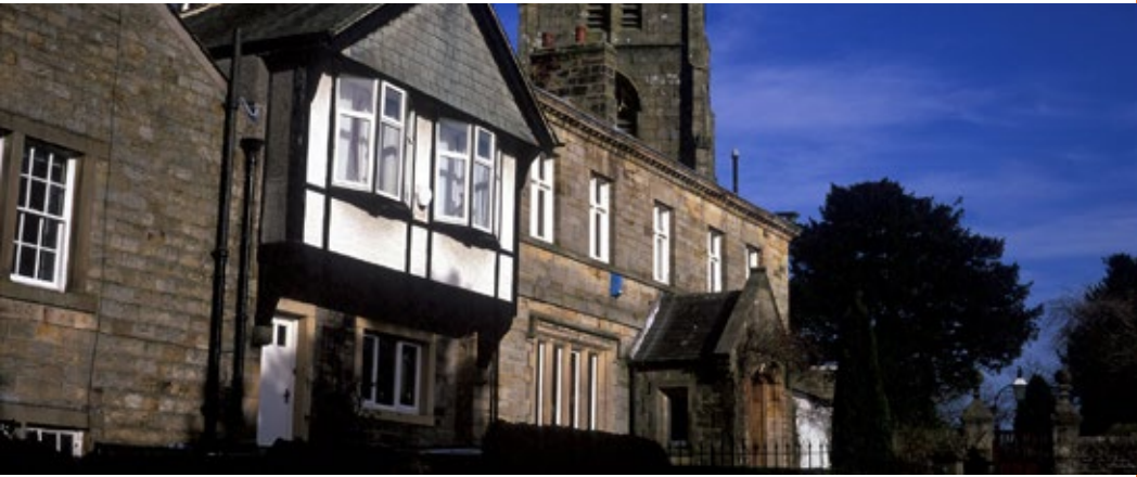
Bolton by Bowland

Waddington , with its babbling brook and beautiful Coronation Gardens, has earned the title of 'Best Kept Village in Lancashire' on many occasions. Before 1974 it was often the best kept village