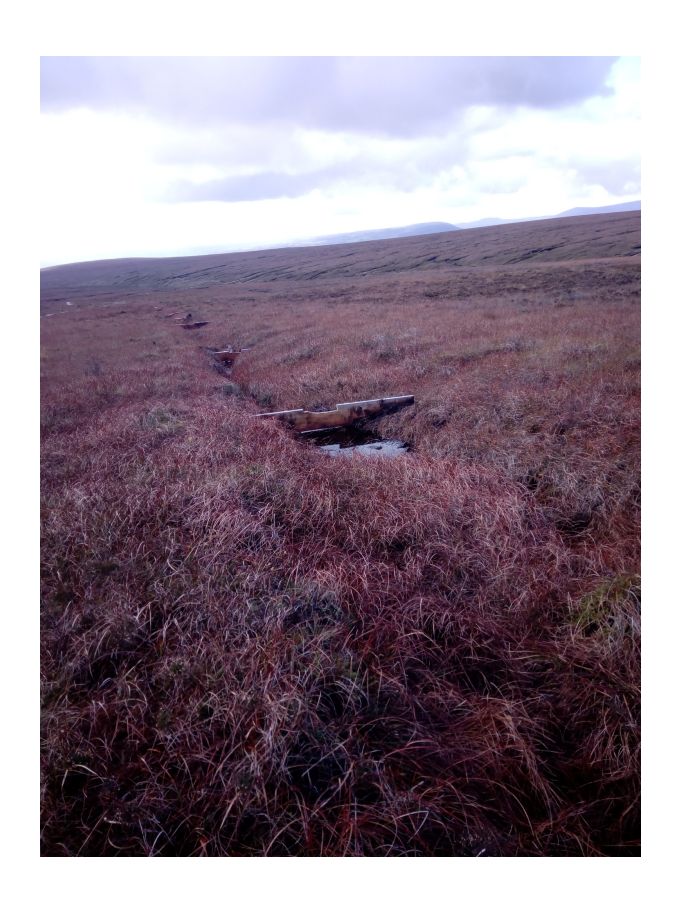
Gully Blocking (53.86661; -2.30584)