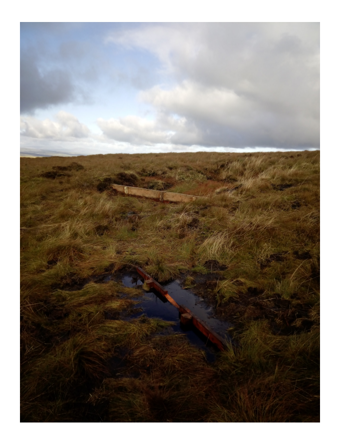
Drainage Ditch (53.86710; -2.30470)