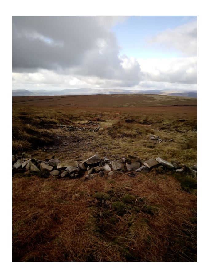
Coir Logs (53.86878; -2.30018)