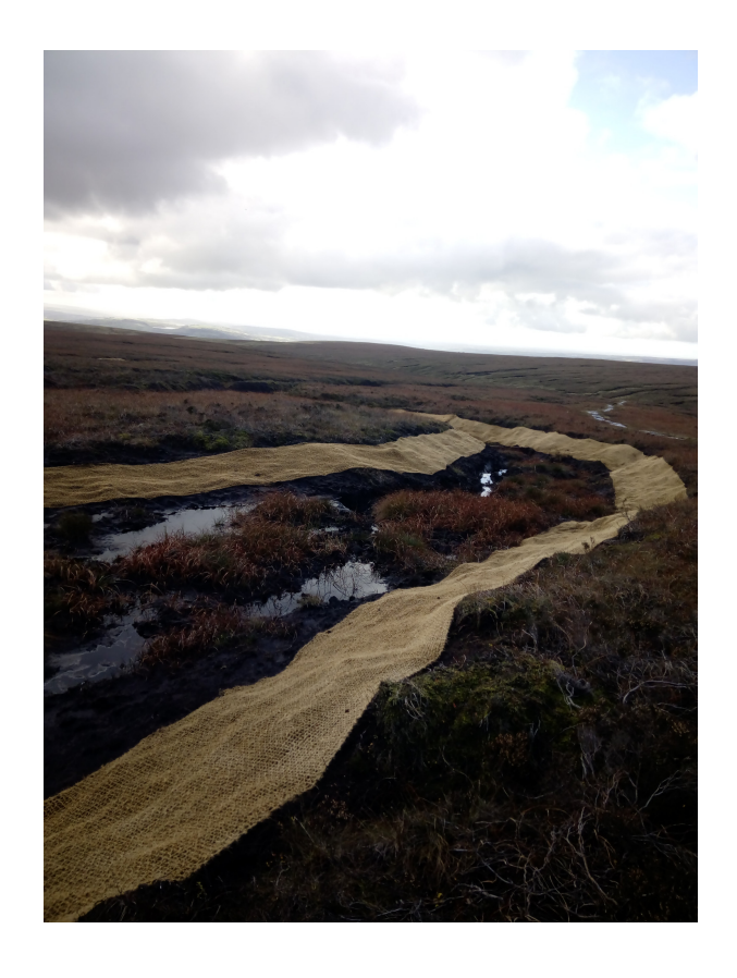
Cut Site with Heather Re-growth (53.86624; -2.30630)