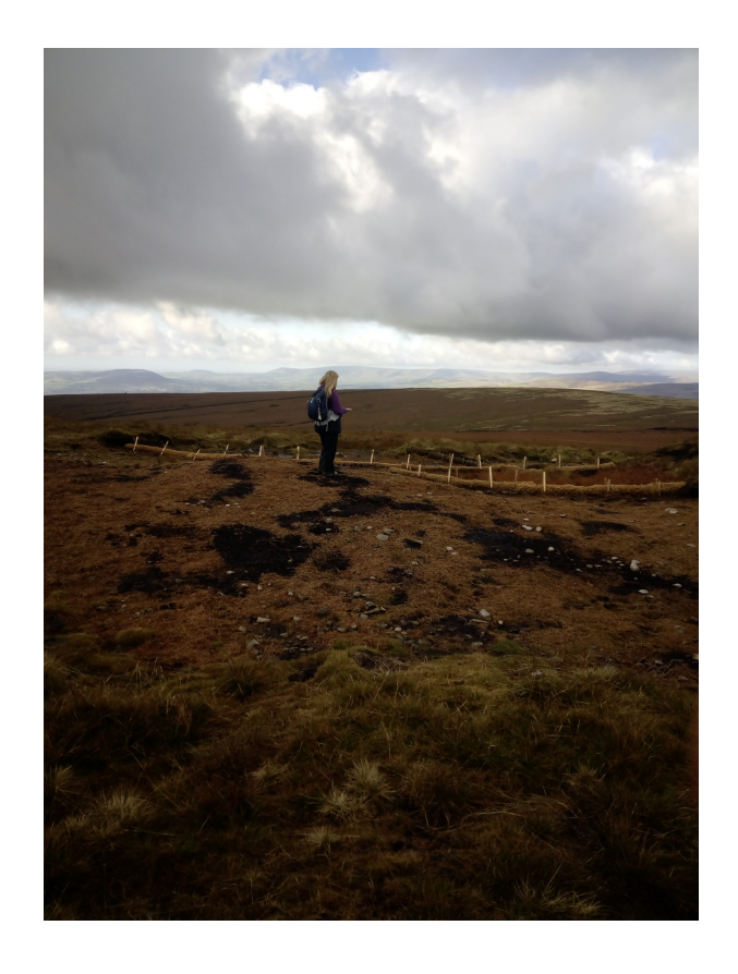
Summit Peat II (53.86881; -2.29934)