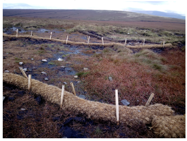
Cotton Grass Re-colonising