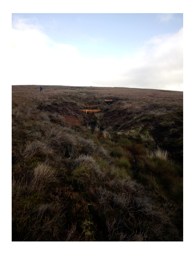
Geo Textile (53.86621; -2.30685)