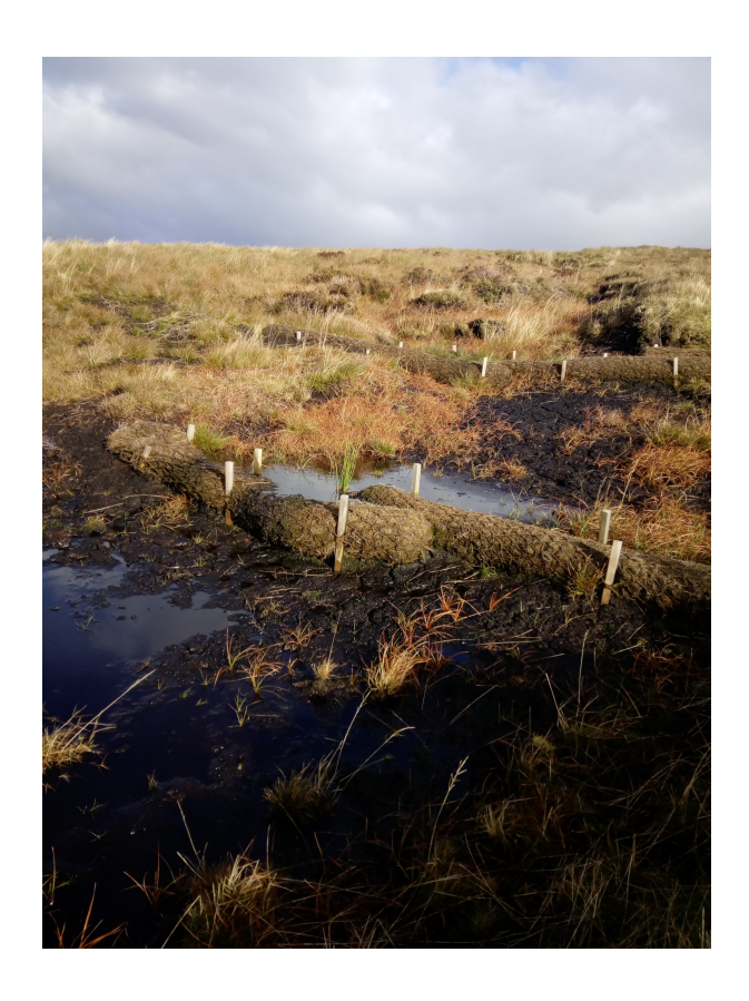
Timber Dam (53.86792; -2.30095)