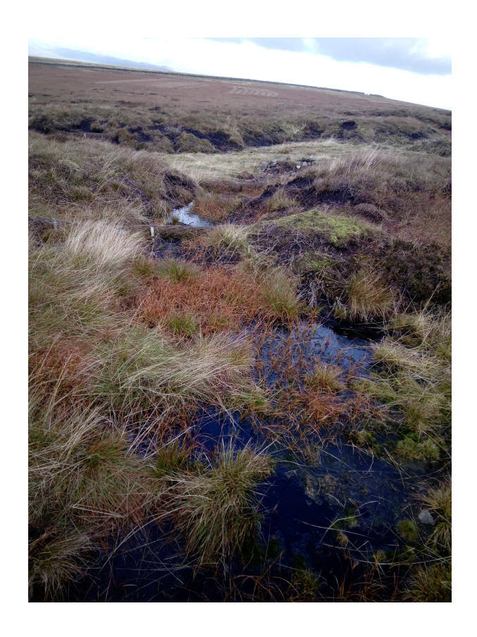
More Coir Pools (53.86840; -2.30033)