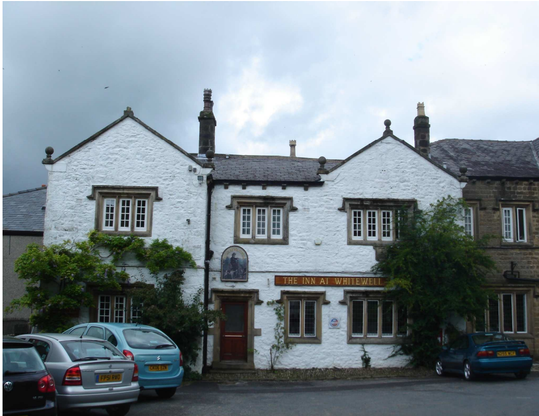
The Inn at Whitewell

1836 by the Towneley Lords of Bowland, that lodge, much extended and changed, is today known as the Inn at Whitewell .