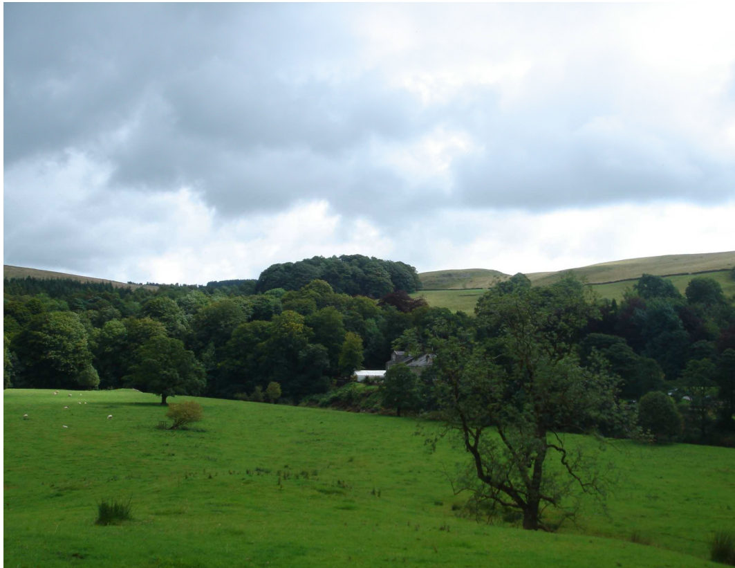
Hall Hill, masked by trees, towering over the Inn at Whitewell

the Domesday vill and deer enclosure (laund) at Radholme. The Hill's natural limestone mound certainly shows signs of being adapted for occupation and indeed, may have accommodated some form of modest fortified