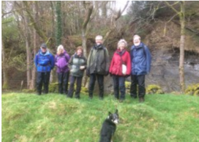
Lowgill Walk 12th April 17