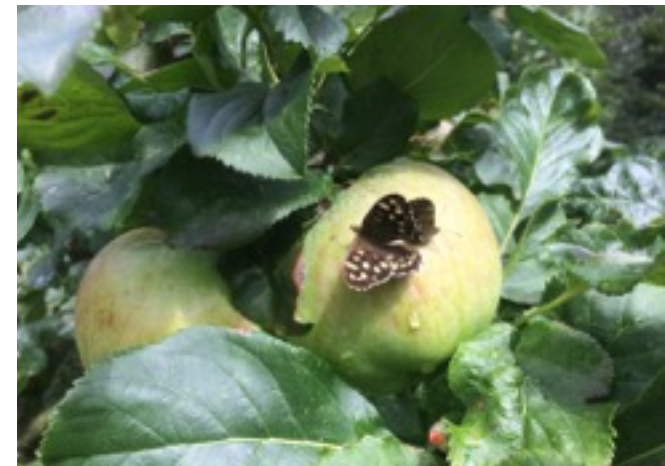
Speckled Wood butterfly Ribchester 4th Sept 2017