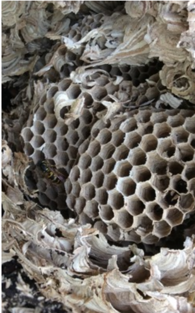
Wasps nest Ribchester Oct 16