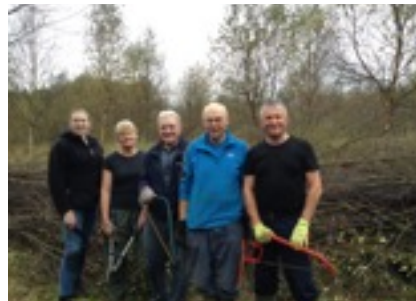
Gisburn Forest 27th Oct 16

Additional task days will be inserted into the programme and advertised by email and website and posters where relevant.