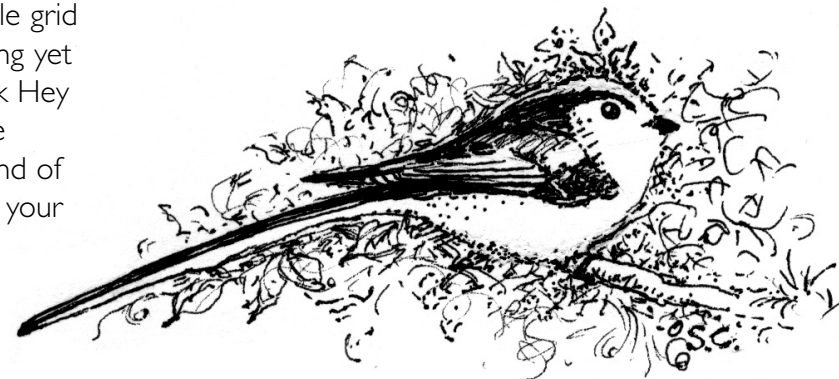
▲ Long tailed tit

14 years ago, after the Catholic Church in Calder Vale had to close, the Catholics and Anglicans joined together and began to raise money to repair and furnish the Mission Room so that both churches could use it. That is how the May Bluebell Teas emerged!'