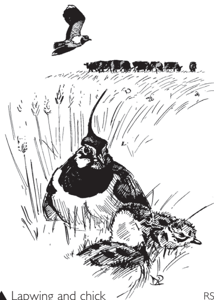
▲ Lapwing and chick

Continue straight ahead up through the field, heading for the gate ahead to lead you along a track into Cobble Hey farmyard.