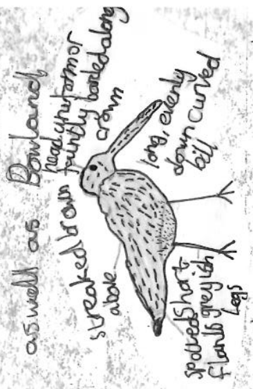
Diagram of a Curlew